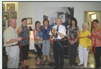
JOYFUL BEGINNINGS LUTHERAN CHURCH 1521 Rice Rd, K-102 903-939-9386