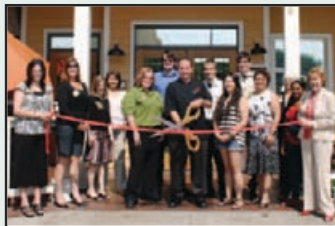
OUTBACK STEAKHOUSE 5704 S Broadway Ave 903-509-8193