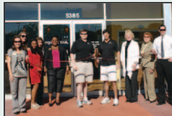
PALM BEACH TAN 5385 S Broadway 903-917-6818