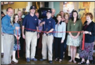
JERSEY MIKE'S 5th & Beckham