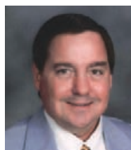
CHRIS SIMONS KITCHENS UNIQUE