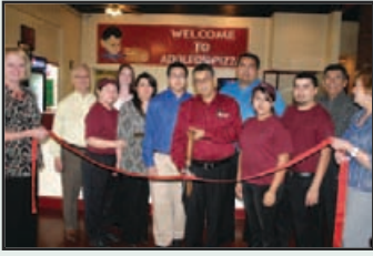
ADOLFO'S PIZZA 2324 ESE Loop 323 903-617-6807