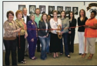
MAPLE LEAF CREATIVE 903-747-3254