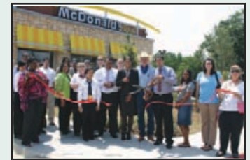
MCDONALD'S RESTAURANT 180 SSW Loop 323 903-595-1524