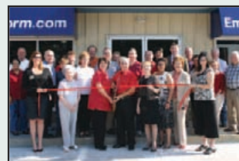
TYLER UNIFORM 4285 Chandler Hwy 903-593-9291