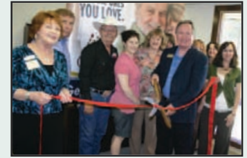
GERIATRIC CARE SOLUTIONS 1800 Shiloh Rd #202 903-561-8644