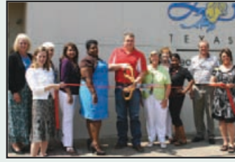
AMERI-TEX SERVICES INC 311 W Main St • Whitehouse 903-839-1800