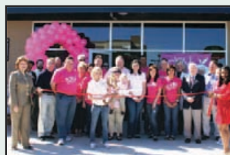
TCBY 7488 S Broadway 903-561-0860