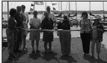
TYLER YACHT CLUB PO Box 130906 • Tyler TX 75713 903-882-2404