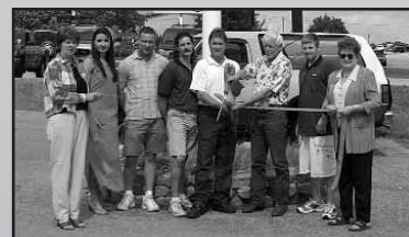
LAMBERT'S WINDOW TINTING AND TRUCK ACCESSORIES 2020 W Southwest Loop 323 • Tyler TX 75701 903-581-5425