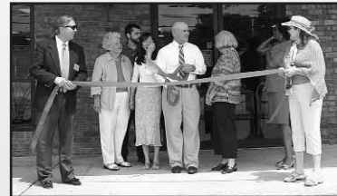
SLEEP SAVVY 3502 S Broadway • Tyler TX 75701 903-509-2337