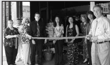
BAAN NITAYA EXOTIC THAI CUISINE 109 E Erwin • Tyler TX 75702 903-535-7850