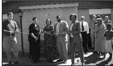
A.D.I.C.T. MINISTRIES 1106 Tresavant • Tyler TX 75702 903-593-4554