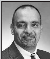
ANWAR KHALIFA PYRAMID HOMES