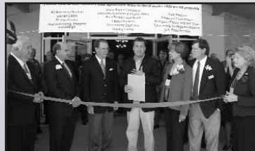
MEALS ON WHEELS MINISTRY 3001 Robertson Rd • Tyler TX 75701 903-593-7385