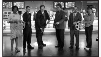
CARMIKE CINEMAS 7415 S. Broadway • Tyler TX 75703 903-939-0260