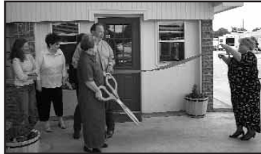
# RV PARK OF TYLER 12421 State Hwy 31 W • Tyler TX 75709 903-597-6966