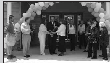
THE PARK AT SHILOH 2911 Shiloh Rd • Tyler TX 75703 903-509-3070