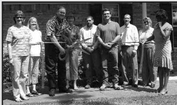
GARY BURTON ENGINEERING INC 14531 Hwy 155 S • Tyler TX 75703 903-561-6984