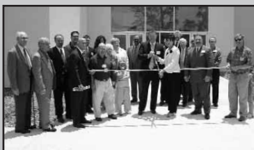
NEW LIFE WORSHIP CENTER 18535 Hwy. 69S • Tyler TX 75703 903-871-8700