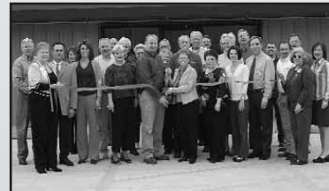
MCKENZIE TILE AND FLOORING 301 S Southeast Loop 323 • Tyler TX 75702 903-596-0346