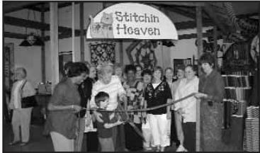
STITCHIN HEAVEN 5201 S Broadway • Tyler TX 75703 903-939-9872