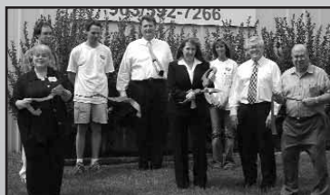
ARCHIVES USA 2948 Specialty Dr • Tyler TX 75707 903-592-7266