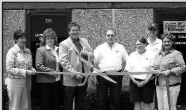
LONE STAR OVERNIGHT 3815 Timms Ste 201 • Tyler TX 75701 903-561-6476